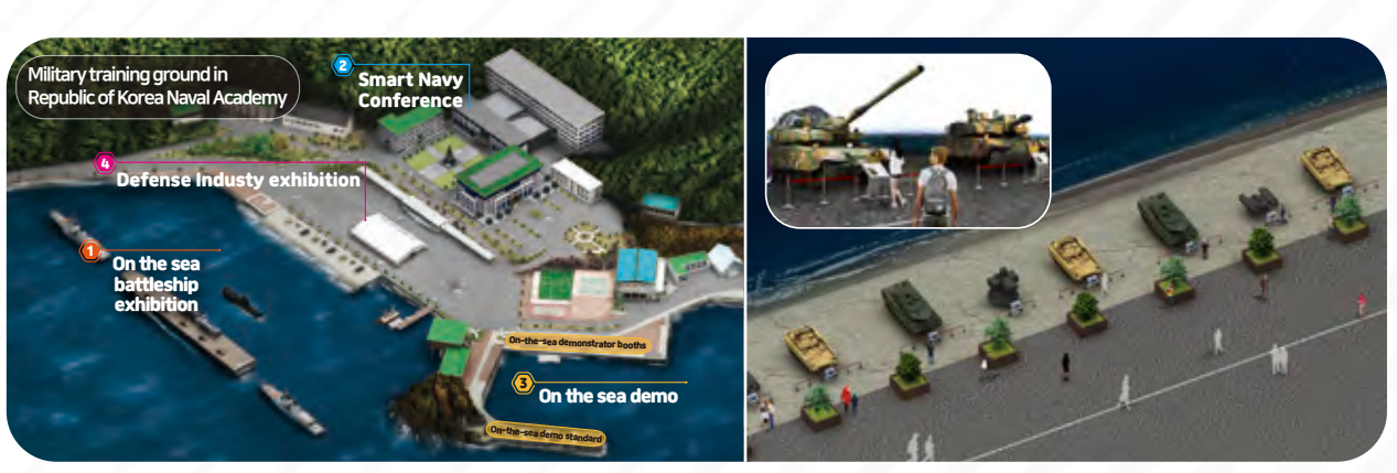
* The Configuration of Offline Exhibition may be changed